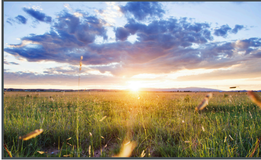
Moriarty, NM

“While the earth remains, seedtime and harvest, cold and heat, summer and winter, day and night, shall not cease.” Genesis 8:22